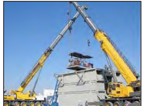
Crane Training Course at Safety Seminars.