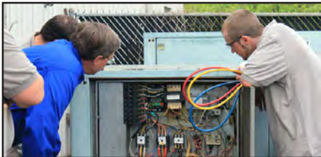
HVAC Training at Regional Occupation Center.

This program is a four week course that will provide the veterans with a certificate of completion for introduction in the fields of HVAC and welding. Another Pilot program that was developed this quarter (just for the veterans in our programs) is through Synergy Learning Institute. This institution developed an automotive